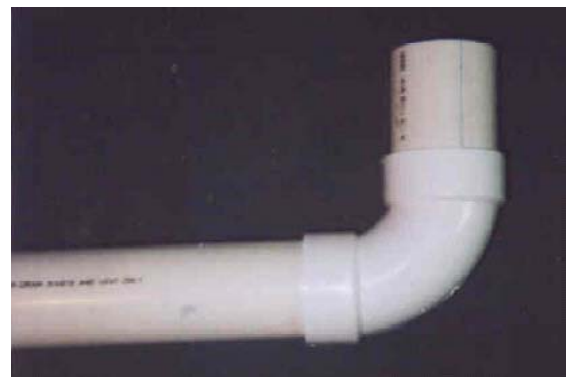
90 Degree Short Sweep in the Horizontal Position