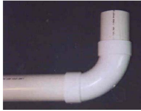
90 Degree Long Sweep